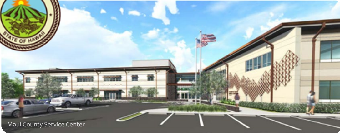
Maui County Service Center